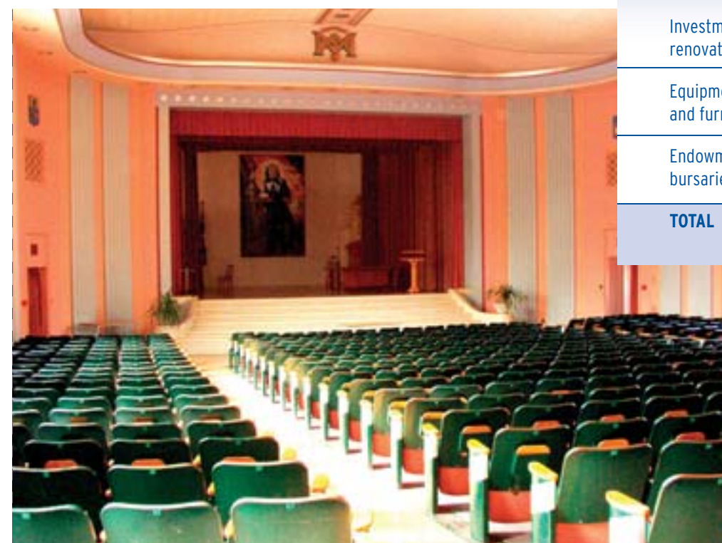
The 614 seat auditorium will become a central gathering point for the entire college community.

Impeccably maintained, spacious in size and flexible in layout, the building is architecturally handsome and easily accessible from anywhere in Montreal. More to the point, the Congrégation de Notre-Dame is providing, on very generous terms, a building whose cost would be otherwise prohibitive for the College. The Sisters will continue to maintain their historic connection to the College, offering a guiding vision of academic excellence and humanistic values. Now, as College governance passes to a lay Board, it is up to us – the community that benefits most from Marianopolis – to complete this project.