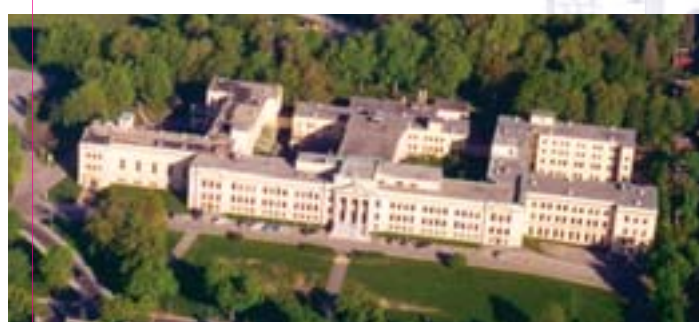
Aerial view of the new campus at 4873 Westmount Avenue.

For the first time, Theatre students will have professional quality rehearsal and performance spaces. Music students will gain specialized spaces for instruction, practice and performance. Creative Arts students will have real studios and exhibition spaces. Science students will gain a Physics lab, as well as larger, safer and better-equipped Chemistry and Biology labs. More and larger classrooms will address overcrowding and scheduling conflicts. And for the first time students will be able to study and tutor one another in spaces appropriate for quiet reflection. All these stimulating environments will incorporate technology to foster communication, learning and innovation.