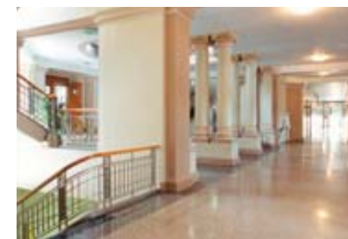
The new campus will offer more spacious facilities with an increased number of classrooms.