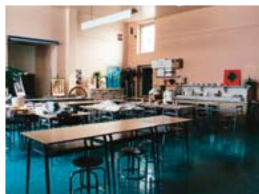
The art studios allow room for our students' creativity.