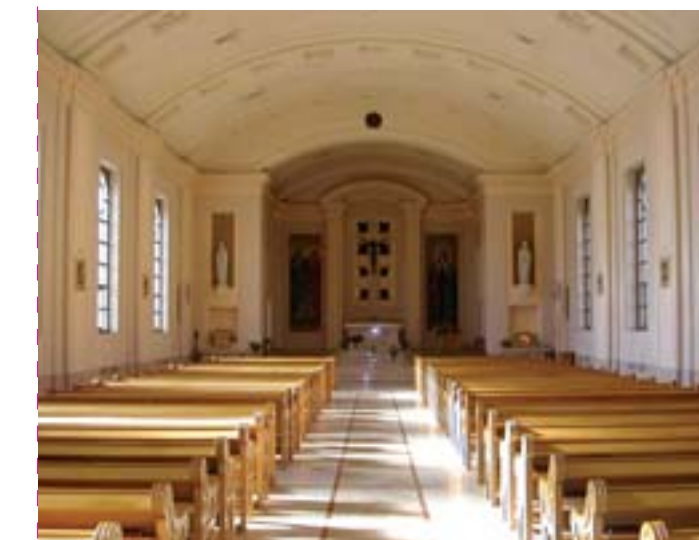
The former chapel will be transformed into a magnificent library.