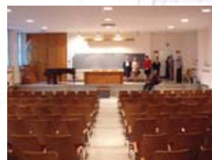
The 214 seat amphitheatre is ideal for musical and dramatic studies.